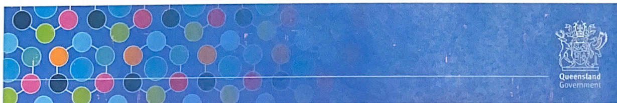
Assistant Regional Director